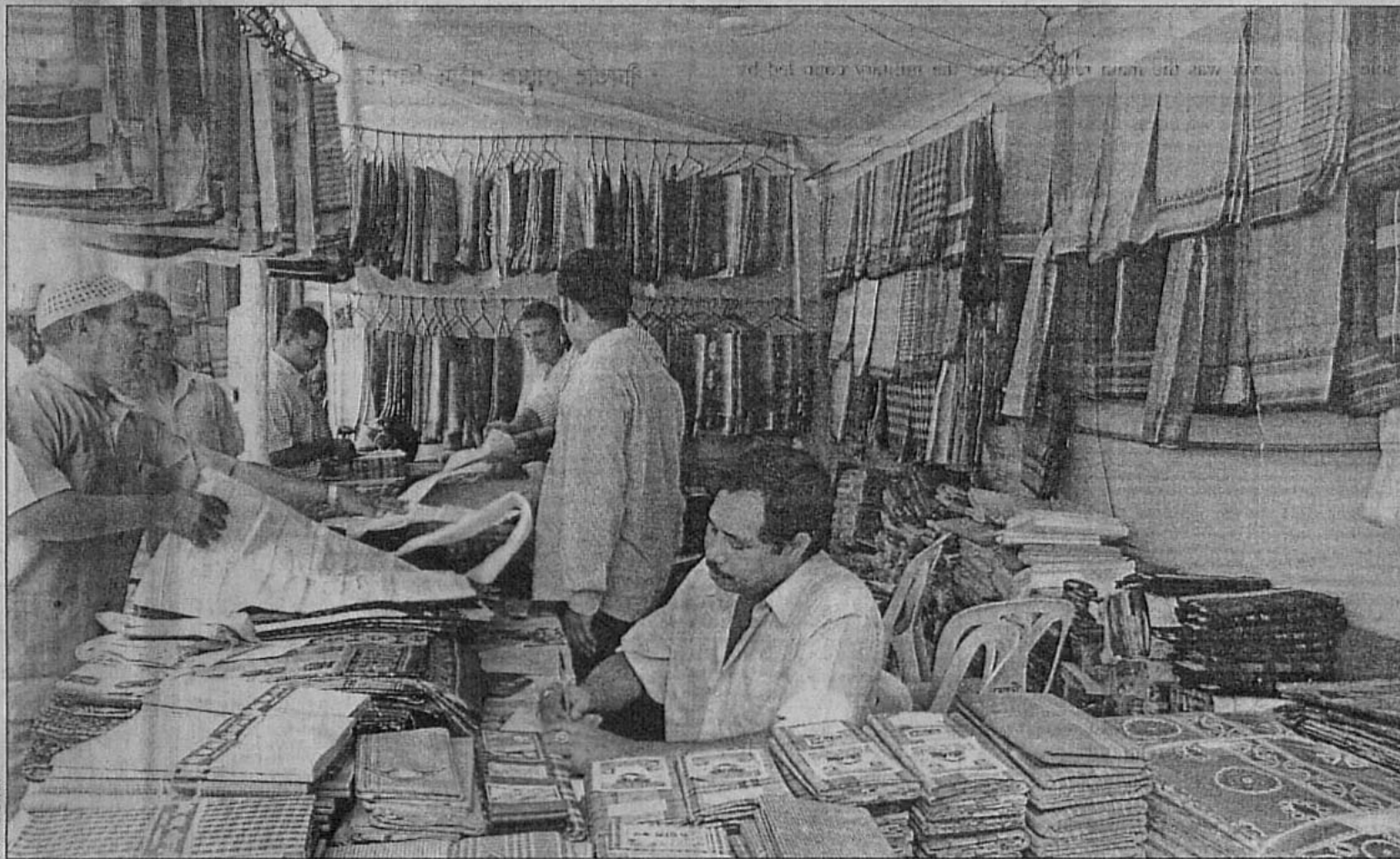
The handloom fair 2004 at Karwan Bazar that began about three weeks back has drawn many customers this year.

The fair tradition began in 1988 and it has become an annual event aimed at promoting the handloom industry since. Bangladesh Handloom Industry, which currently has over nine thousand members, organises at least three annual fairs to promote the products.