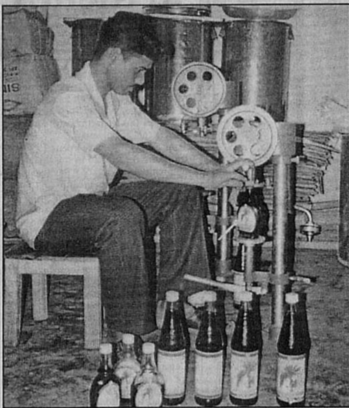
Processed date juice being bottled at a factory in Kajoli Barzar in Magura.

In Bangladesh, Arong and Nandan are wholesalers of the item, he said.