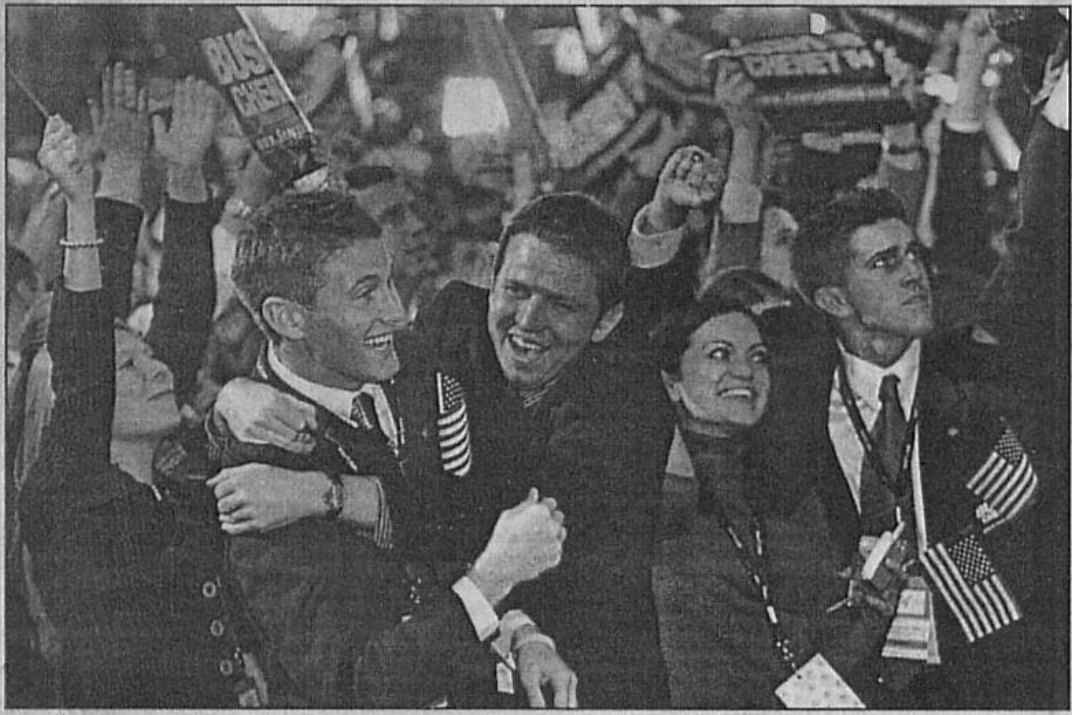
Republicans celebrate as polls show US President George W. Bush winning the state of Florida during a post-election celebration yesterday in Washington, DC.