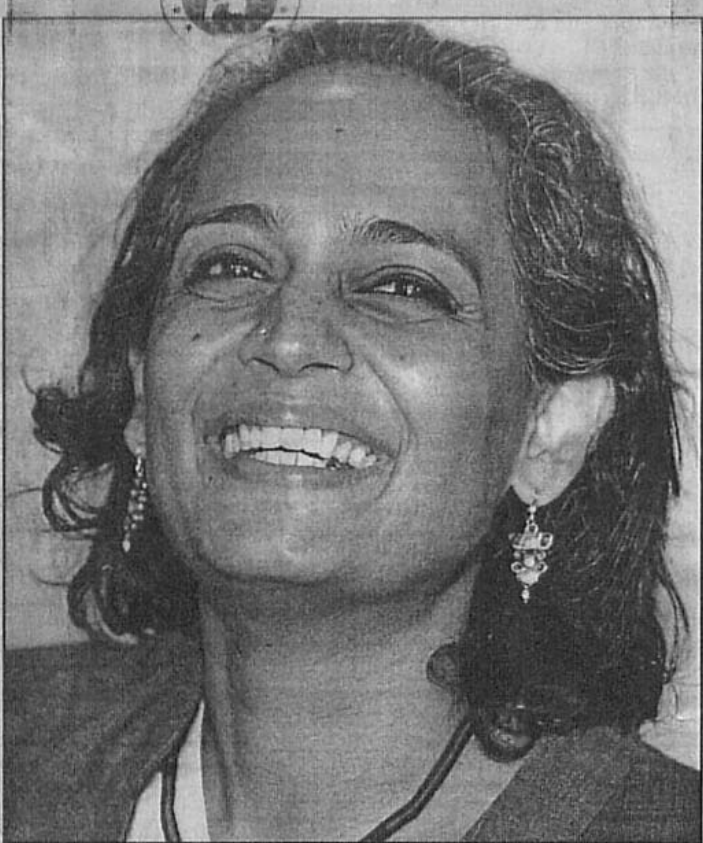
Arundhati Roy, the award-winning Indian novelist and human rights campaigner, is all smiles after winning the Australian Peace Prize in Sydney yesterday.