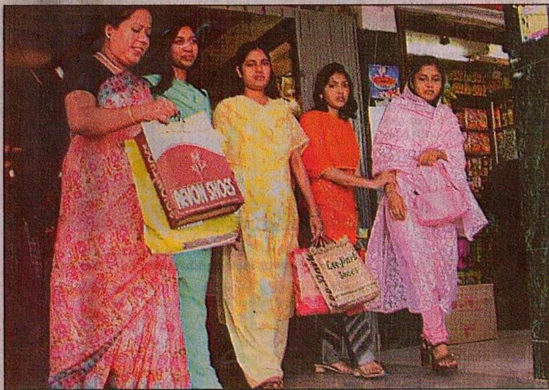
Eid shoppers coming out of a posh shopping mall in the city.