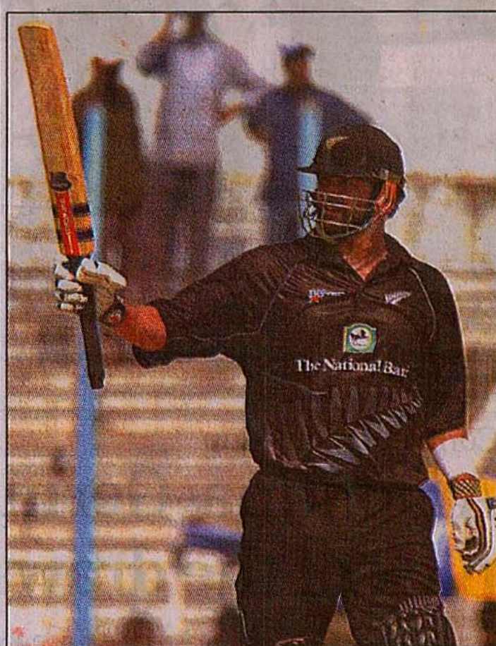
ON A RAMPAGE: New Zealand all-rounder Chris Cairns salutes the Chittagong crowd upon reaching his half-century in the opening ODI yesterday.

But soon it was time to say Zohr prayers and a long queue was spotted near the washroom as devotees prepared themselves.