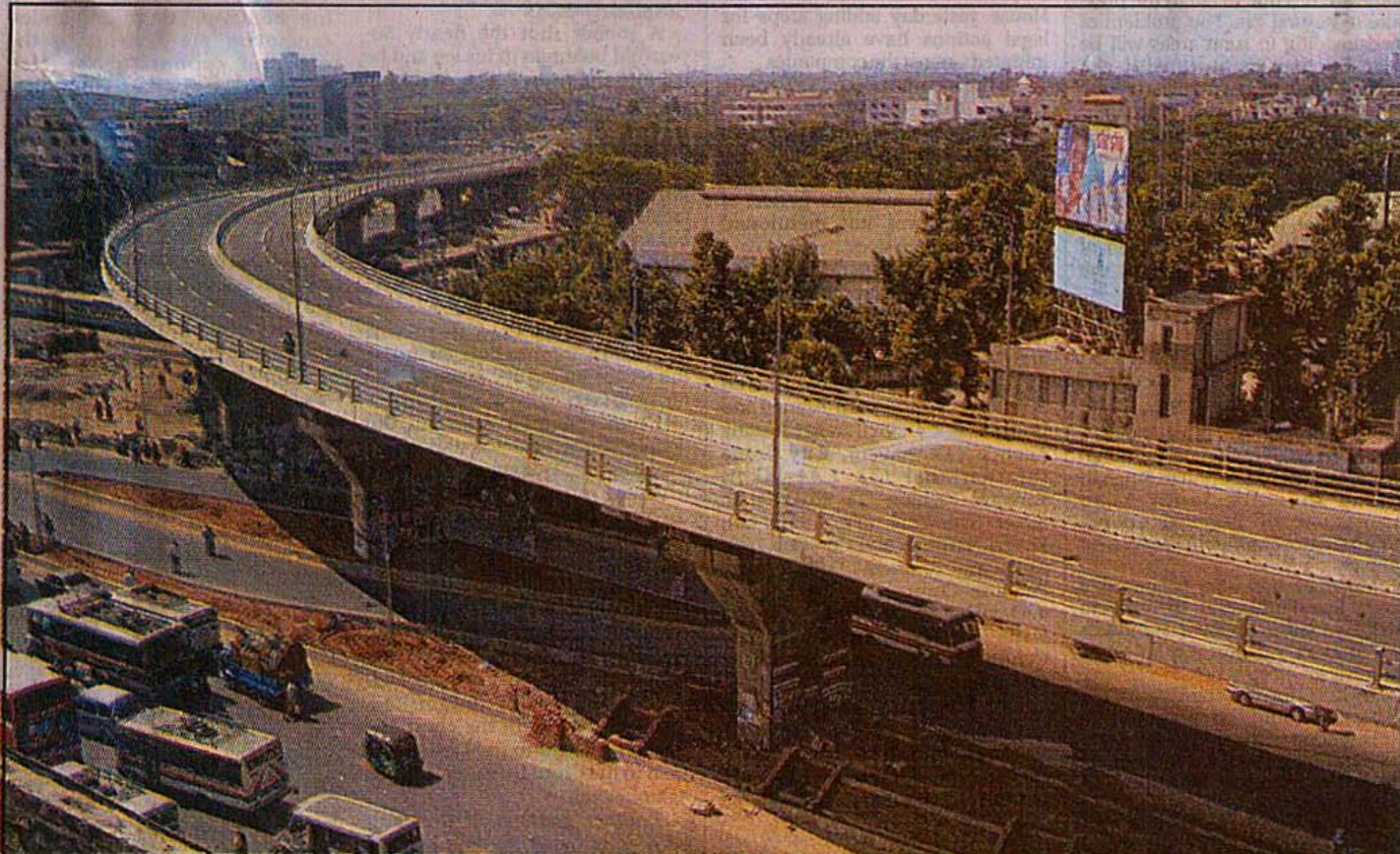
The 1.12-km long and 17.9-metre wide Mohakhali flyover, the first of its kind in the country built at a cost of Tk 114 crore, opens to traffic in the capital tomorrow, three days before schedule amid a raging controversy over safety issues.

Tel - Dhaka : 8110163, 9882192, 9896285, 9569613, Ctg. : 653758, 637669, Khulna : 720304, 723695, Bogra : 66215 &amp; to all authorized dealers.