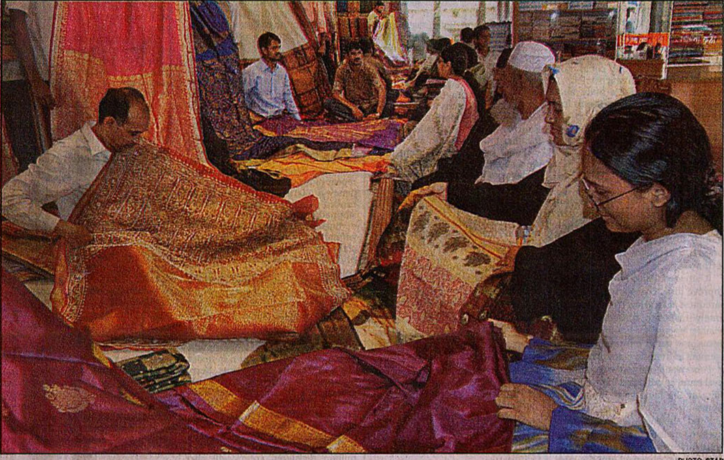
Eid-shoppers choose from a variety of popular Benarasi saris at a shop in Mirpur Benarasi Palli in the capital yesterday.

Jin suggests ways to get more FDI STAFF CORRESPONDENT The visiting Asian Development Bank (ADB) Vice-president Liqun Jin yesterday stressed independence of the judiciary, increased gas, electricity, water supplies, and a transparent tender process for Bangladesh's getting more foreign investment. Jin made the observation as head of a five-member delegation that met Communications Minister Nazmul Huda to discuss his agency's assistance in the development of communication infrastructure. Huda sought ADB help for launching electric train service between Dhaka and Chittagong and building a 6.01-kilometre Padma bridge. He told Jin the government has moved to build separate dedicated express ways between Dhaka SEE PAGE 11 COL 1