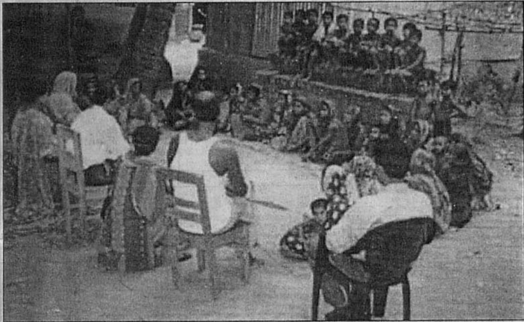
Women and children at a discussion meeting on fundamental rights and human rights organised by Rabindra Sangsad, Selidah (RSS) at a village in Kushtia recently.

"These meetings benefit all because local educated people also attend those and discuss things frankly. The meetings also discuss various socio-economic problems and ways to overcome those".