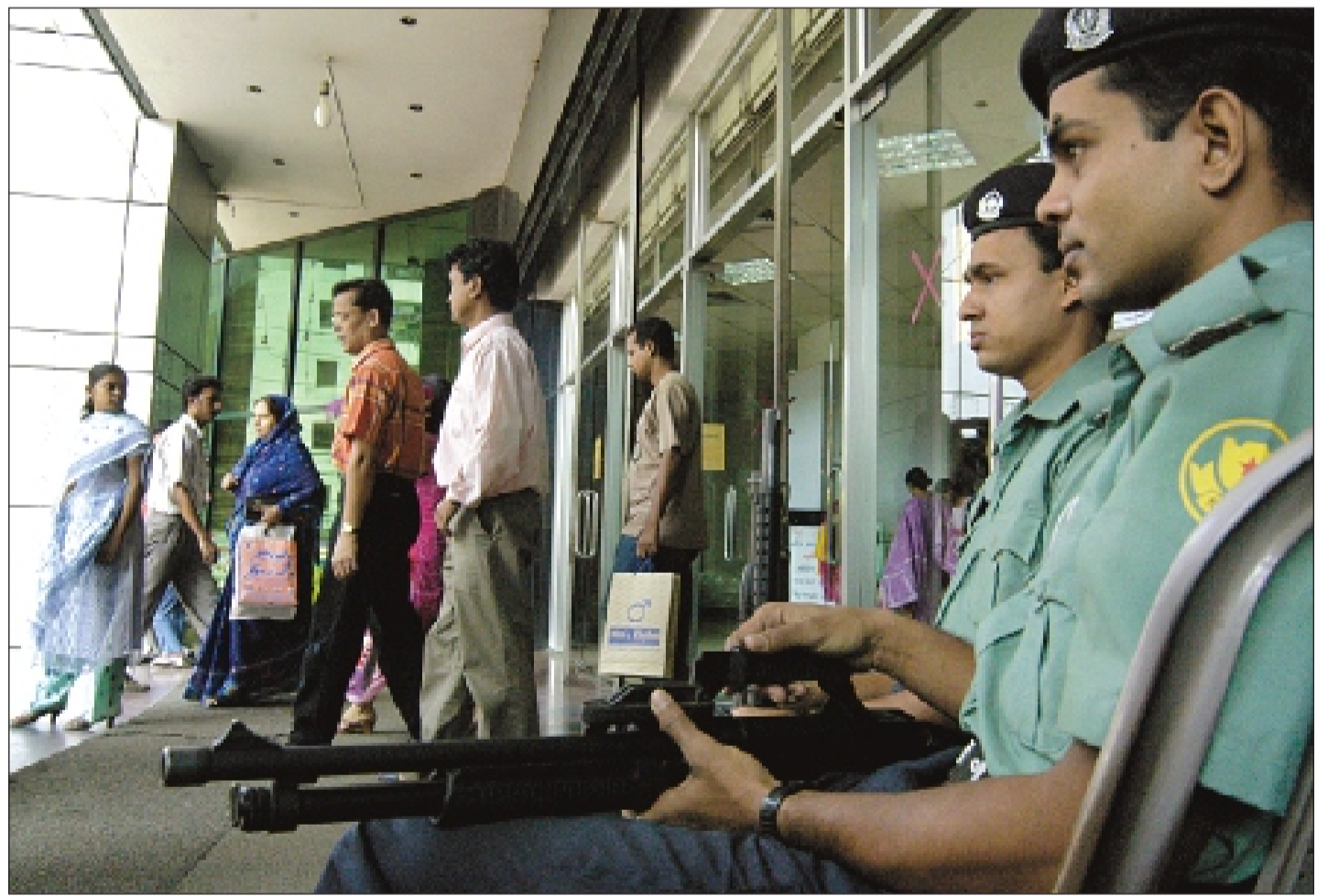
Two policemen guard the entrance to Concord Twin Tower at Shantinagar in Dhaka yesterday as part of the heightened security measures for Eid shoppers at major shopping centres.