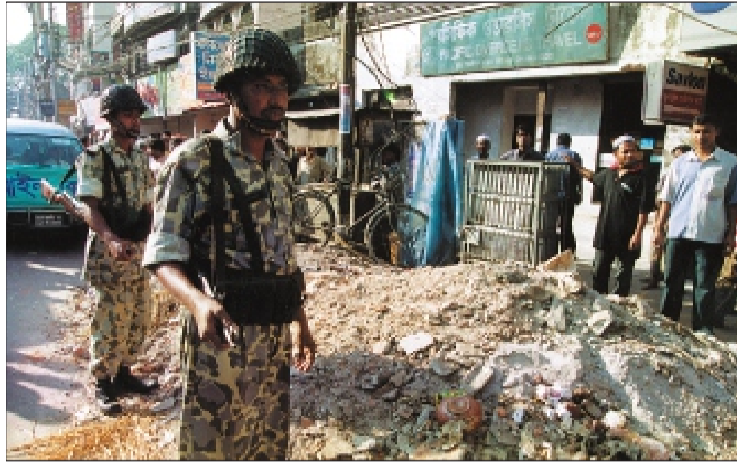
A mobile court yesterday fined real estate developers, left, for roadside dumping of construction materials and waste and restaurants, right, for adulteration of foods and selling Iftar items on Topkhana Road in the capital.