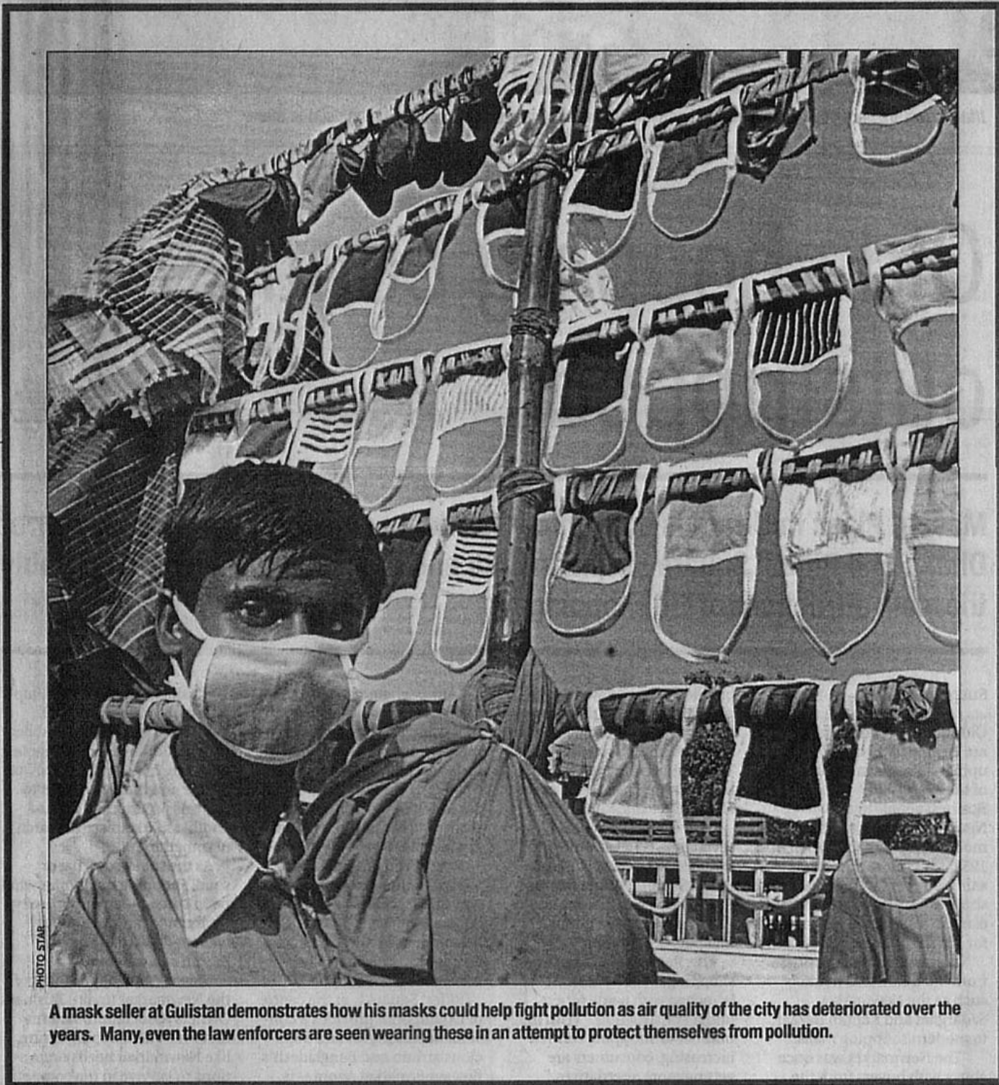
A mask seller at Gulistan demonstrates how his masks could help fight pollution as air quality of the city has deteriorated over the years. Many, even the law enforcers are seen wearing these in an attempt to protect themselves from pollution.