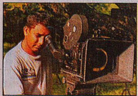
The actor-turned-director Tauquir Ahmed

Here Tauquir shares his views on some issues on his mind: Experiences in the course of filming Joyjatra I have a few keywords to describe my experiences with Joyjatra : hectic, nerve racking, thrilling. The boat shooting is one of the toughest shooting experiences in the world