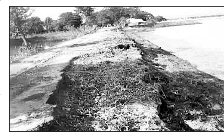
A view of Netrakona-Kalmakanda road near Gutura market, snapped on Friday.

est deposit of China Clay. Same is the condition of roads to Atpara, Madan and Kendua upazila headquarter from the district town.