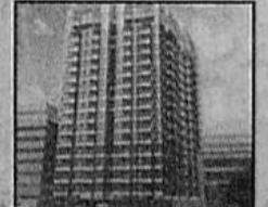
RUPAYAN Galaxy 46 New Eskaton Road, Dhaka. Apt. Size : 1250-2030 Sft.

এছাড়াও বিশেষ ছাড়ে রূপায়ন-এর এ্যাপার্টমেন্ট, অফিস স্পেস ও শো-রুম বরাদ্দ চলছে : ধানমন্ডি, উত্তরা, কাকরাইল, বনানী, মহাখালী, কলশান, নিকেতন, লক্ষ্মীবাজারসহ সকল আকর্ষণীয় লেভা লোকেশনে।