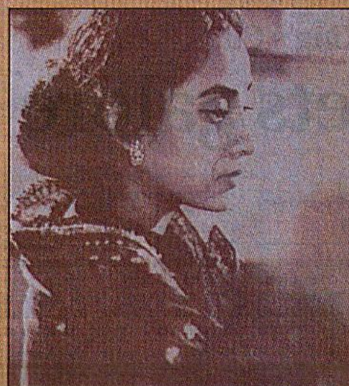
Anwara in Nawab Sirajuddaula