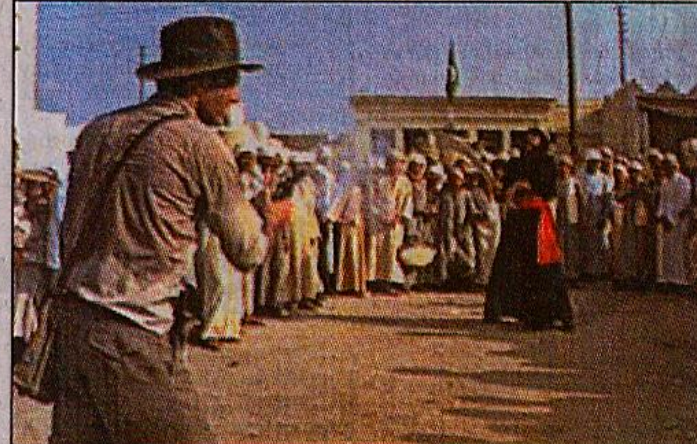
A scene from the first Indiana Jones movie Raiders of the Lost Ark