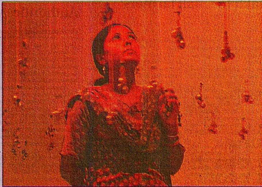
The artist amidst her works