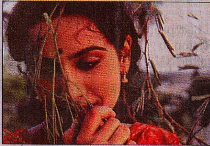
Vidya Palan as Anandi in Bhalo Theko

For Anandi, happiness means freedom from within and without alike. Freedom means a commitment to live in the fashion one wants to—breaking from the bondage—materialistic and nonmaterialistic. Freedom means being one with the