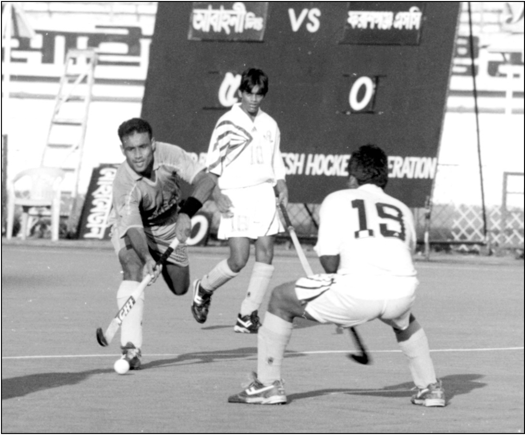
Action from yesterday's Club Cup hockey match between Abahani and Farashganj at the Maulana Bhashani National Hockey Stadium.