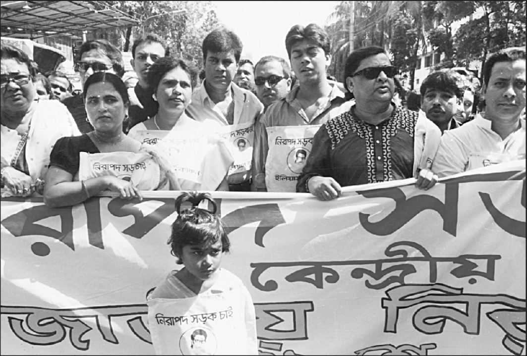
Nirapad Sarak Chai (We Demand Safe Road) took out a procession at Kakrail yesterday to mark Road Safety Day.