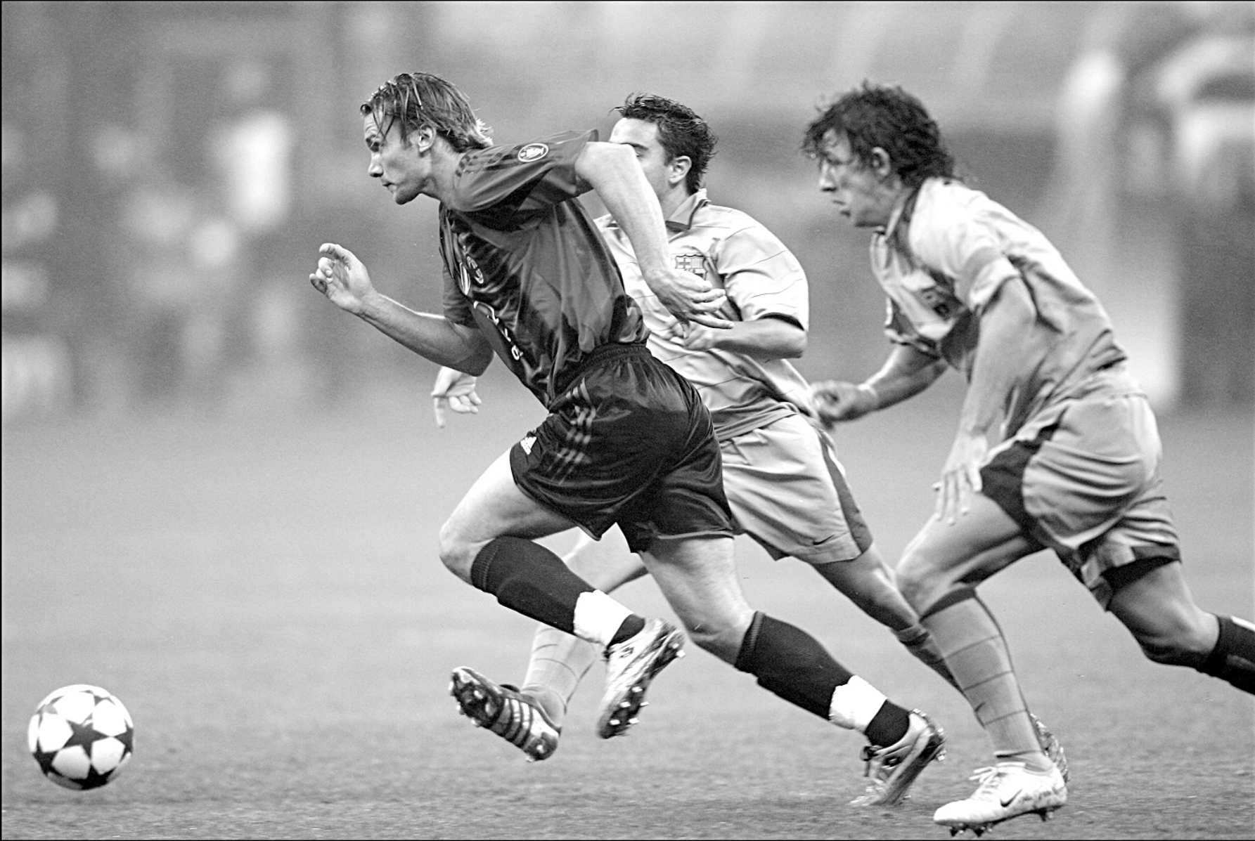
RUN SHEVA RUN! AC Milan's Ukrainian superstar Andriy Shenvchenko (L) leaves Barcelona players Xavi (C) and Carles Pujol in his wake at the San Siro stadium in Milan on October 20.

top with Ronaldinho showing some delightful touches on the left flank and Deco, a Champions League winner with Porto last season, making a nuisance of himself in and around Milan's penalty box. Filippo Inzaghi, Shevchenko and Cafu spurned chances to increase Milan's advantage before Nelson Dida was called into action, diving low to to palm away Ronaldinho's vicious drive. Milan appeared content to sit on their lead and their change of tack almost cost them dear. Ronaldinho evaded a flurry of