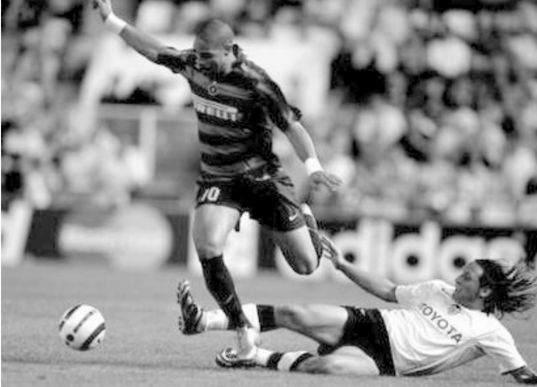
Inter Milan hotshot Adriano (L) skips past a tackle from Valencia's Francisco Rufete at the Mestalla stadium in Valencia on October 20.

AFP, London Paul Gascoigne, who will forever be remembered for crying during England's World Cup semi-final defeat to Germany in 1990, is no longer. The man known worldwide as Gazza, as much for his riotous personal behaviour as his sublime footballing skills, believes it's time to change his name now that he has kicked drinking. So, step forward G8. It is nothing to do with the group of eight leading industrial nations, rather it is a combination of his surname and his old shirt number. "G8 is right for us now," said Gascoigne. "It sounds a bit like great, or it does with my Geordie accent."