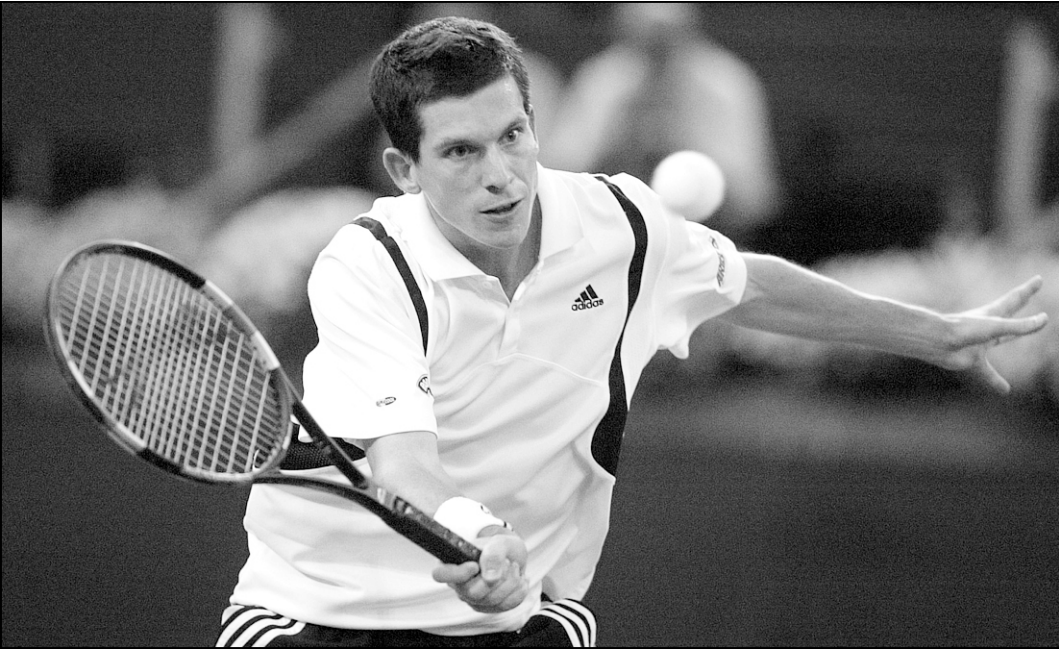
Briton Tim Henman is about to make a return against Croatian Ivan Ljubicic in the Masters Series in Madrid yesterday.

The wipeout in the second round left the former world number one gasping at his rollercoaster ride