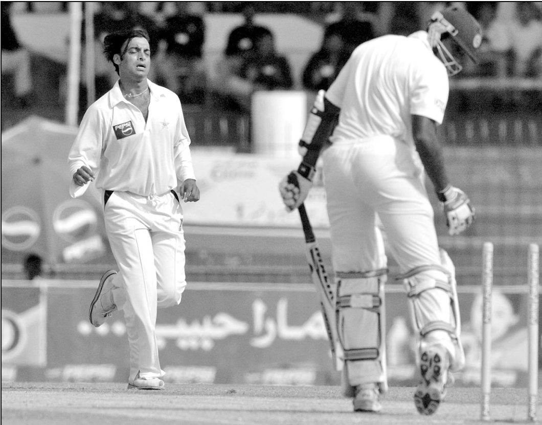
Sri Lanka's Dilhara Fernando looks back after his middle stump was uprooted by Pakistan fast bowler Shoaib Akhtar (L) on the second day of the first Test in Faisalabad yesterday.

Australia lead the series 1-0 after winning the opening Test in Bangalore and drawing the second Madras Test after rain washed out the final day's play last Monday.