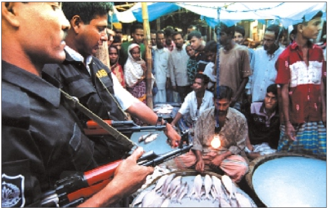
With their arms pointed at traders, Rab members inquire about fish prices at Doyaganj Kitchen Market yesterday.