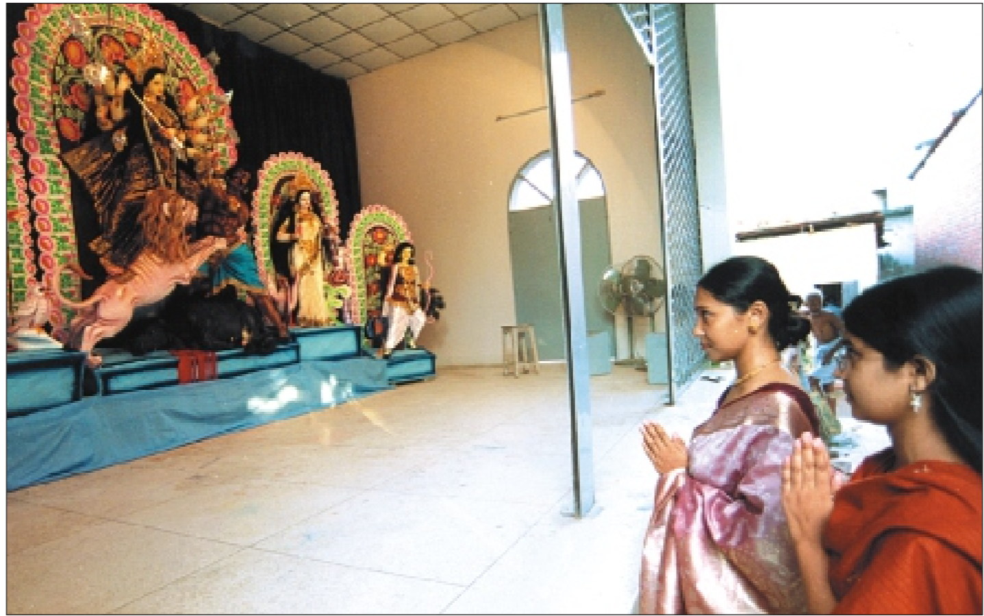
Two Hindu devotees offer prayers to Goddess Durga on Mahasaptami at Dhakeshwari National Temple Puja Mandap in the capital yesterday.