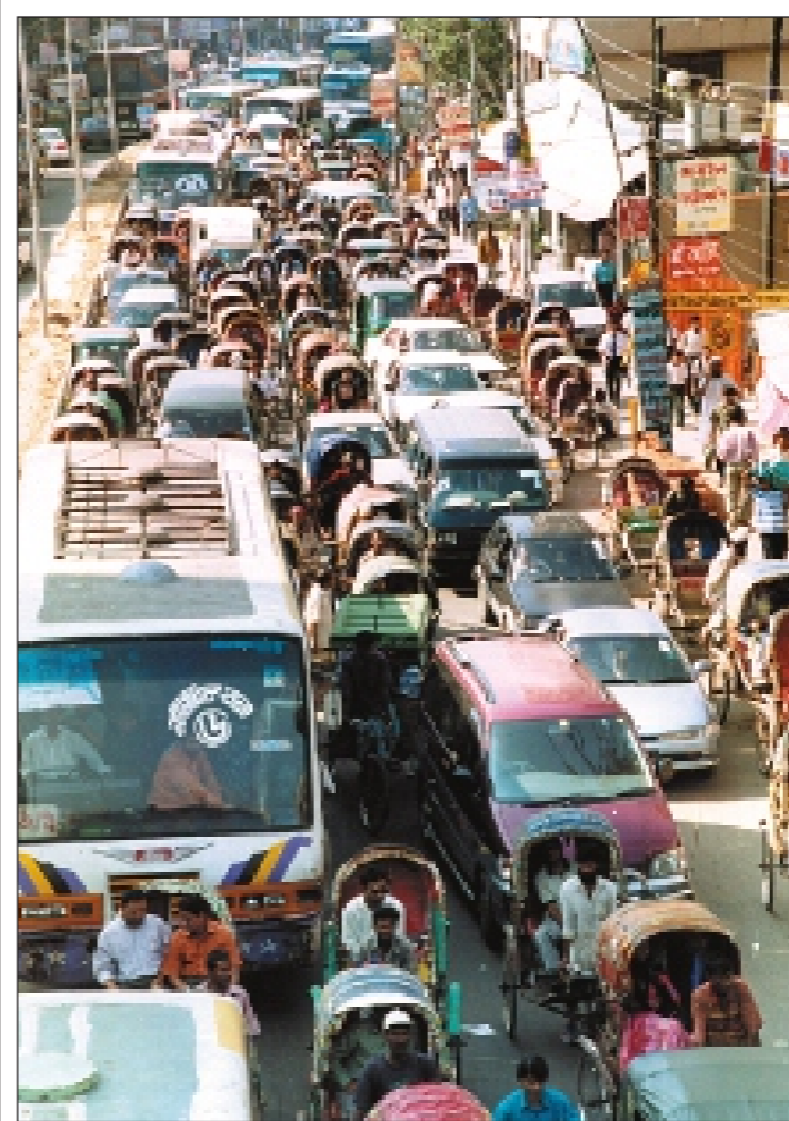
Commuters suffer as usual, as the long tailbacks in Malibagh area yesterday made a mockery of the just held Traffic Week.