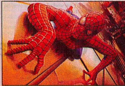
Spiderman On HBO at 9:30 p.m. Genre: Action/Adventure Cast: Toby Maguire, Illem Dafoe, Kirsten Dunst

All programmes are in local time. The Daily Star will not be responsible for any change in the programme.