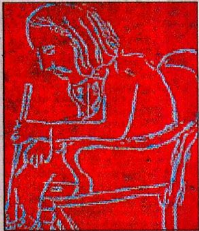
Lalon Chandro Rai, while others say he was called Lalun Chandro Das. His mother was known as Padmabati Devi.