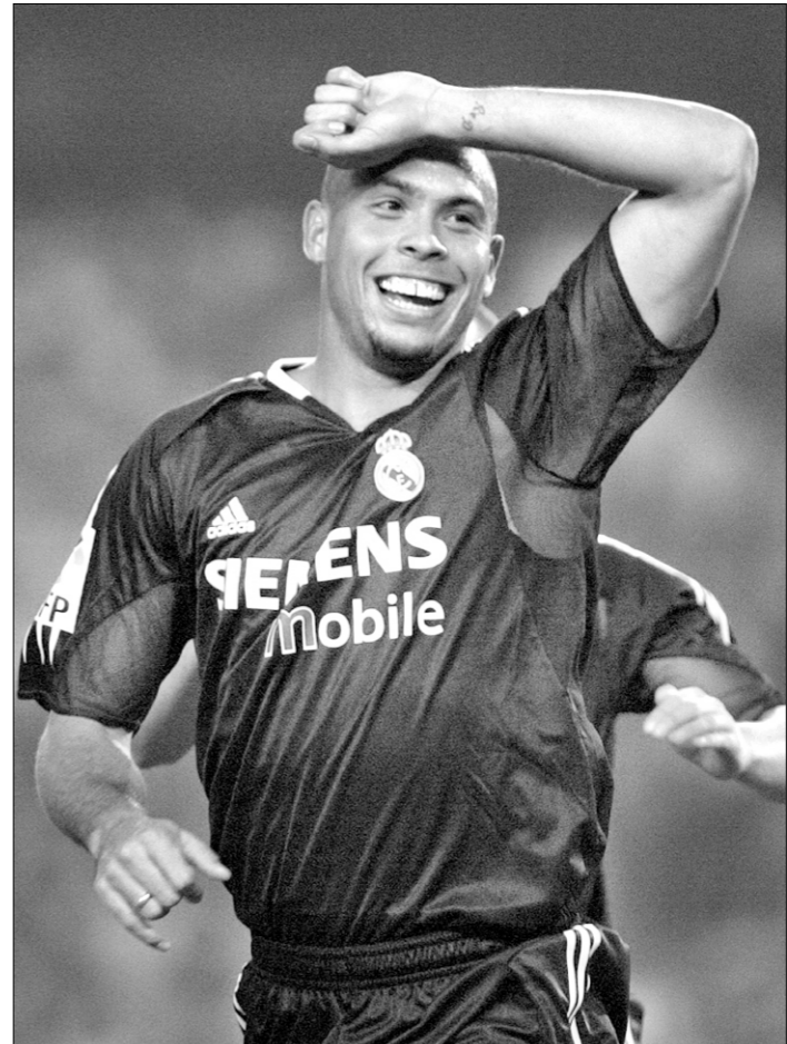
Superstar Ronaldo celebrates his equaliser in his latest style during Real Madrid's match against Real Betis at the Ruiz de Lopera stadium in Seville on October 16.