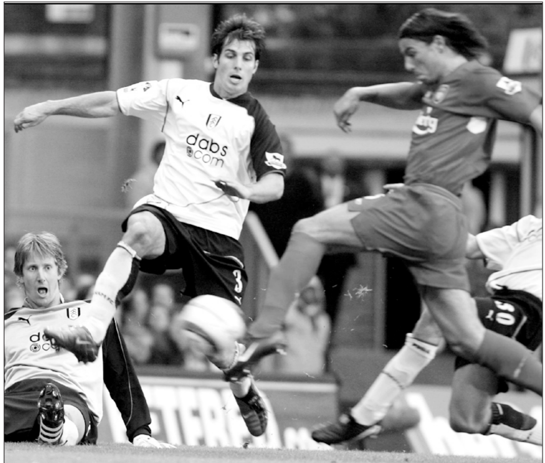
Liverpool's Czech forward Milan Baros (R) scores with Fulham's Carlos Bocanegra (C) and goalkeeper Edwin van der Sar watching at Craven Cottage in London on October 16.