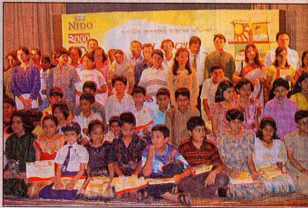
Prize-winning child-writers with the judges

The prize distribution programme of the competition, tagged Galpo Lekho Galpo Jeto (write story, win story), took place at the Shishu Academy auditorium on October 14. It was a cheerful gathering of children literally from all social milieus: schools and madrasahs of different districts across the country; a few ethnic children were also there from the hilly areas. The children were jovial and very disciplined and well mannered. The organisers were anxious