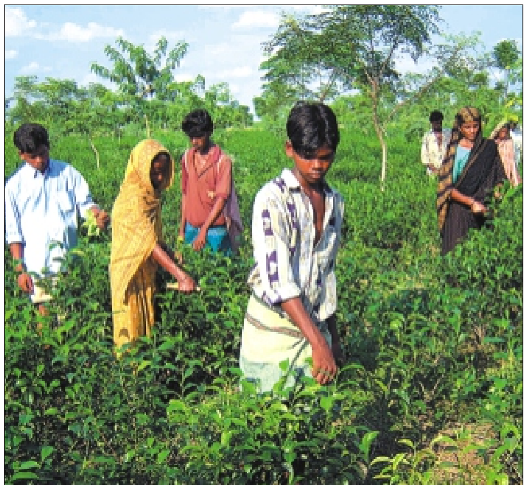
Gone to waste... Labourers at Dahuk Tea Estate in Panchagarh recently pluck tealeaves only to throw them away in the absence of a tea processing plant.