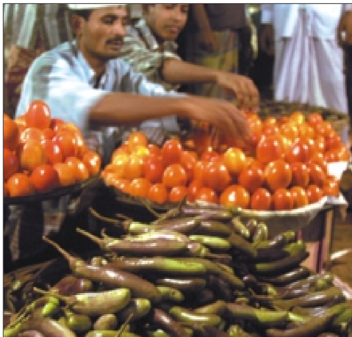
Too hot to handle... the prices of aubergine, left, spiralled to a new high of Tk 80 a kg from Tk 55 and other popular iftar items including dates ranged between Tk 50 and Tk 250 a kg against Tk 40 to Tk 150 in the capital's Karwan Bazar Kitchen Market yesterday on the eve of the Ramadan.