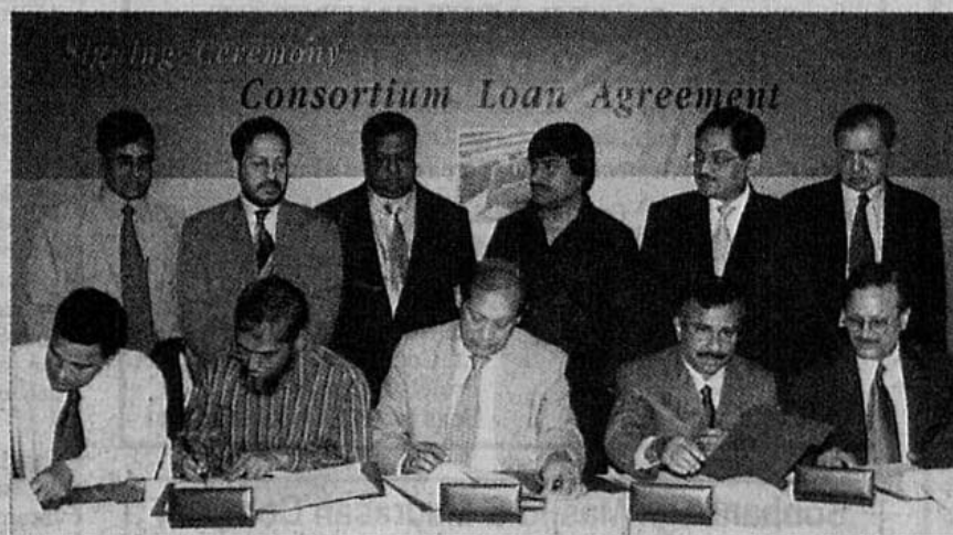
Consortium loan agreement signed on 14 October 2004 at Sonargaon Hotel

Beacon Pharmaceuticals Limited will be the first pharmaceutical plant of Bangladesh to manufacture full range of modern anticancer products as well as other specialized drugs. It will play the role of 'light for life' to the ailing humanity. It has been designed by an internationally reputed pharmaceutical manufacturing facility development consultant, TELSTAR S. A. based in Spain. The facility will fully comply with the regulatory norms of European Standard. The project will cost Tk. 72.72 Crore (first phase) against which Tk. 43.25 Crore will be financed by consortium bank loan. It will complete in June 2005.