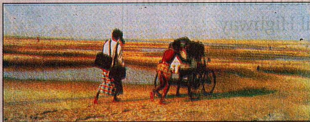
A still from the film Sand and Water