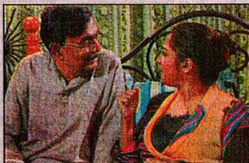
Shonali Danar Chil On Channel I at 9:35pm Drama Serial