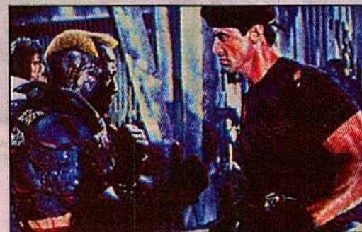
Demolition Man On HBO at 9:30pm Genre: Action/Adventure