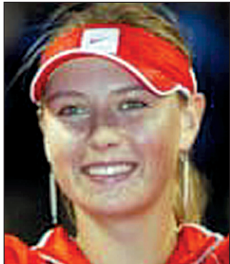
Maria Sharapova (Wimbledon champion)

"I am so happy that I could defend my title in Tokyo. I played some really great tennis this week. I really showed my fans that I am the Wimbledon champion. It's just a great feeling to win here."