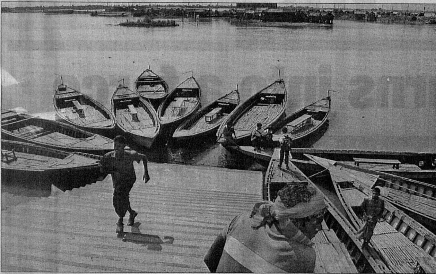
A stairway from the toll station at Rayerbazar leading to the boats that carry passengers to the other destinations stand bare of any security.