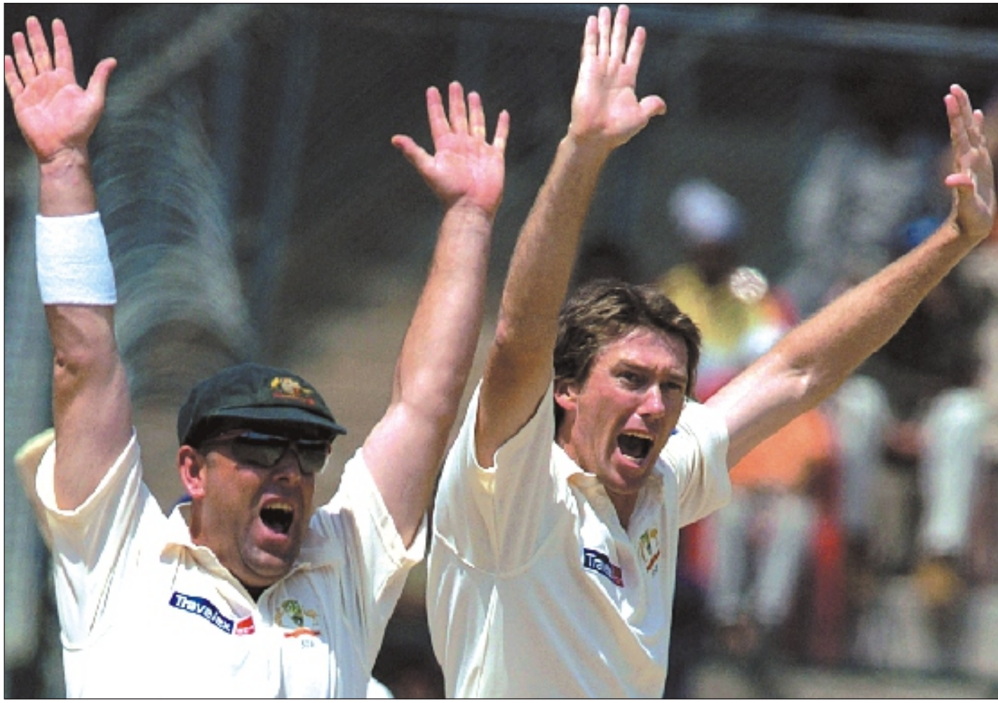
HOWZZAT? Australia paceman Glenn McGrath (R) and teammate Darren Lehmann successfully appeals for an lbw decision against India opener Virender Sehwag (not in picture) in the second innings on the fourth day of the first Test in Bangalore yesterday.