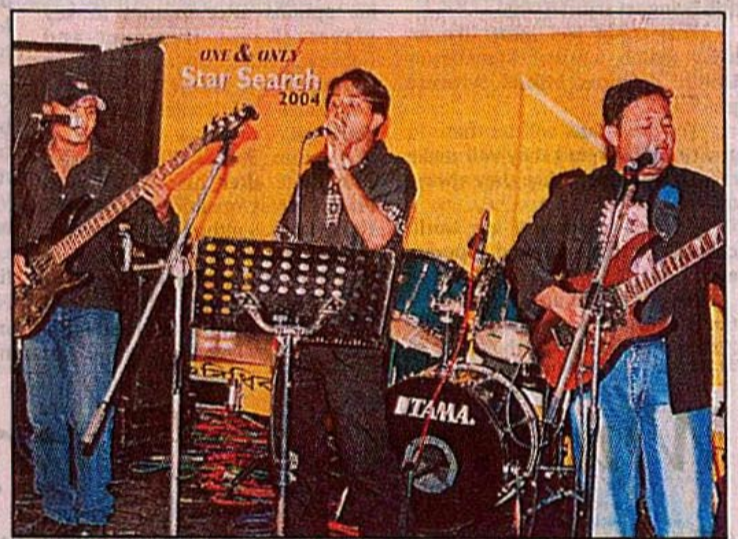
Salvation was awarded the best band from Rajshahi

time popular songs. In the final round, the best 15 of the solo performers and bands will perform in the Benson & Hedges Star Search 2004, to be held at Dhaka. The last regional audition of the competition will be held in Sylhet on today.