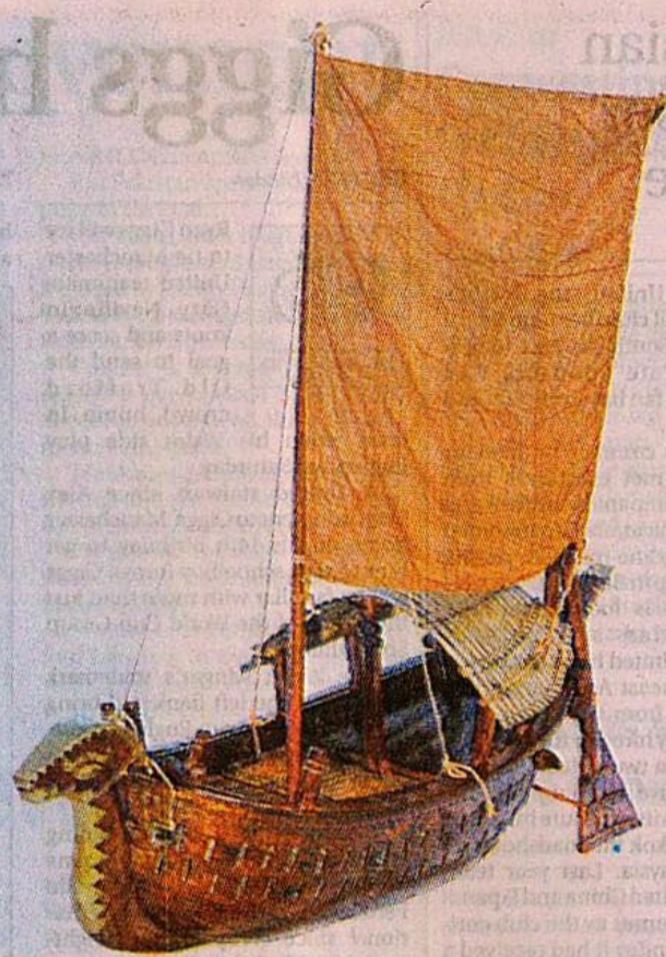
Ghughi boat from Sylhet

The traditional boats of Bengal not only differ in designs; these designs are also among the safest ones in the world as well as the most well-adapted to the Gulf of Bengal.