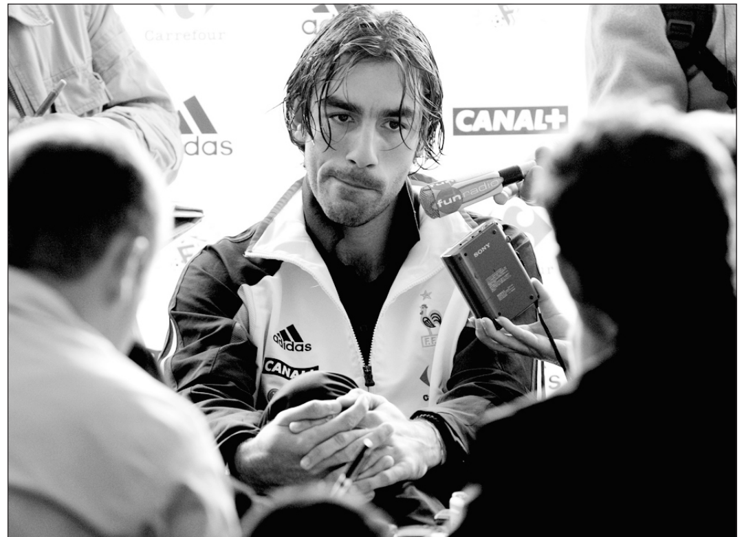
French midfielder Robert Pires talks to the press at the team's training base in Clairefontaine, outside Paris yesterday. The 1998 winners face Ireland in a 2006 World Cup qualifier at the Stade de France tomorrow.