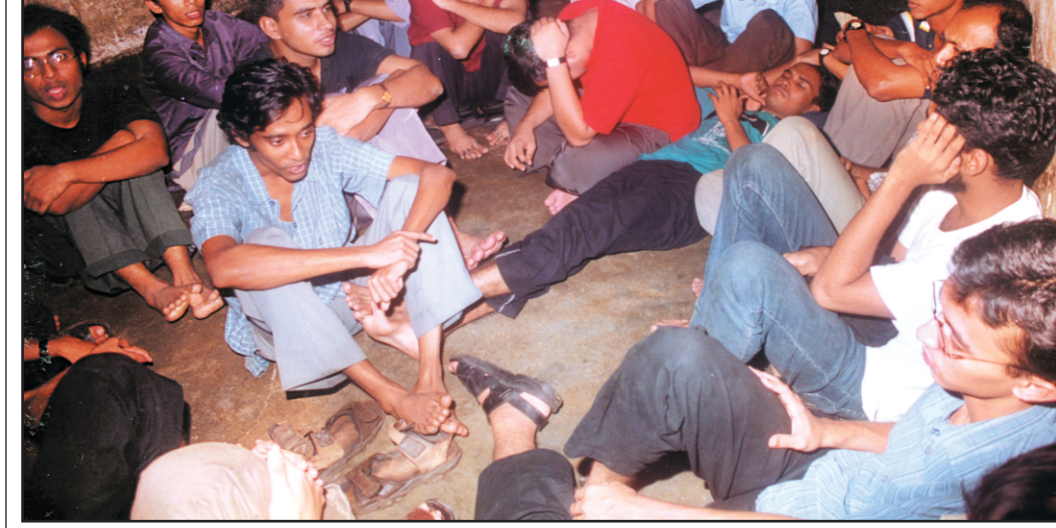
Ramna police detain 26 Buet students at the police station yesterday after arresting them from the Buet campus for protesting the price hike of admission form