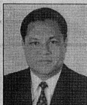
Air Vice Marshal (Retd.) Altaf Hossain Choudhury Minister Ministry of Commerce Govt. of the People's Republic of Bangladesh 30 September, 2004