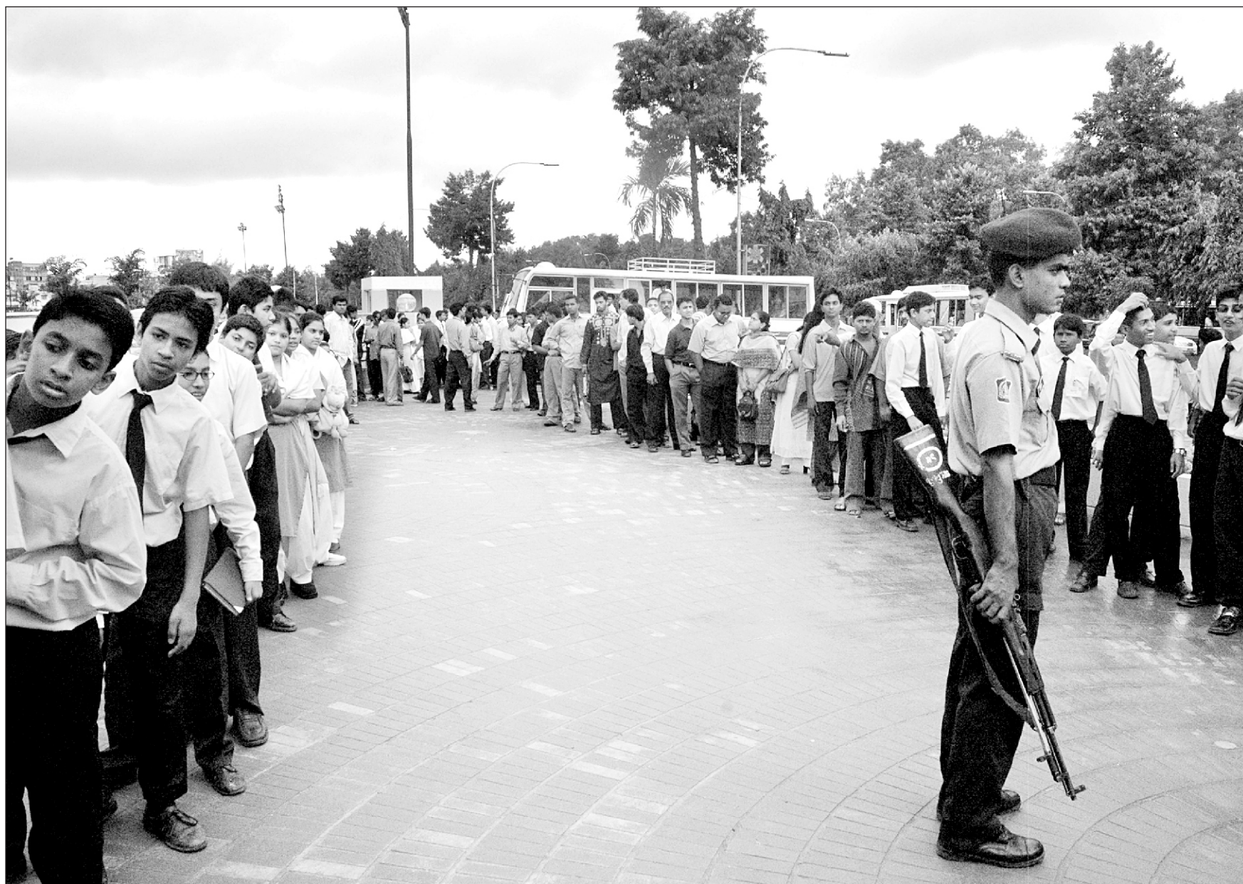
Enthusiasm and curiosity have crept into many city dwellers who are found waiting in lines for long hours to see what is inside the Novo Theatre.