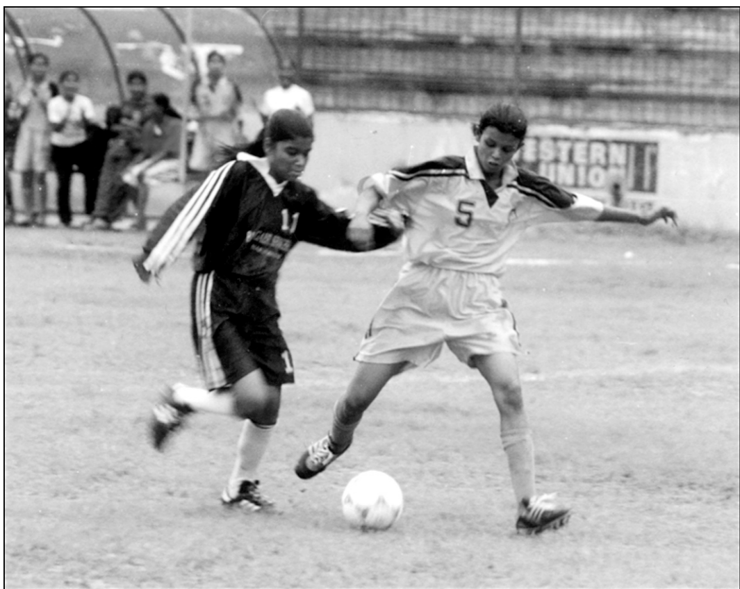
Action from yesterday's women's football tournament encounter between Khulna and Narayanganj at the Bir Shreshtha Mostafa Kamal Stadium in Kamalapur.