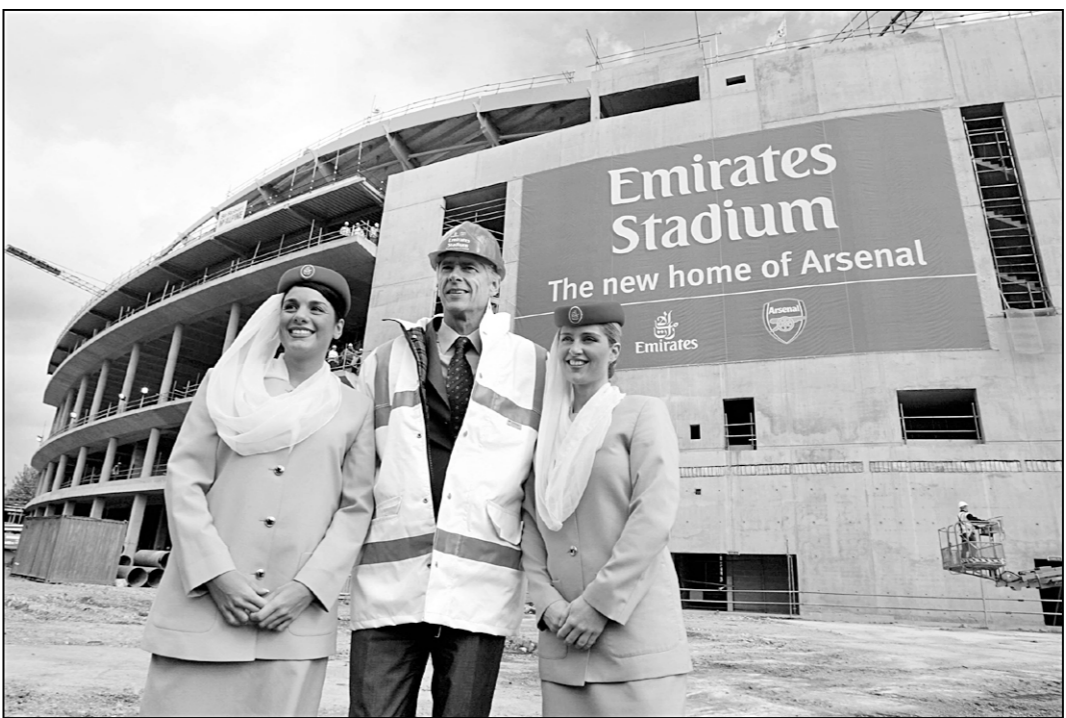
Arsenal manager Arsene Wenger poses with fight attendants from Emirates Airlines in front of Arsenal's new stadium in London on October 5. Arsenal's new 60,000-seater ground at Ashburton Grove, which is scheduled to open for the 2006-07 season, will be known as the Emirates Stadium for the next 15 years after they agreed a 100 million pound deal with Emirates Airlines. The Gunners have been at their Highbury ground, which now has a capacity of only 38,500, since 1913.