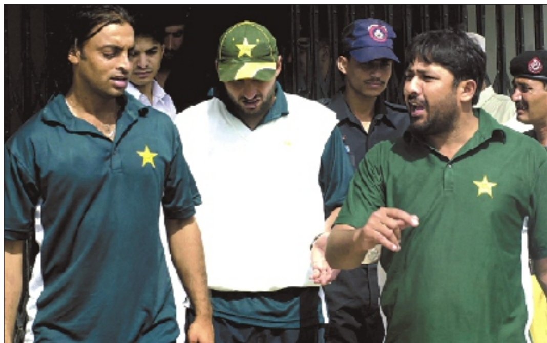
BE FAST AND FURIOUS: Pakistan captain Inzamamul Haq (R) tells something to his fast bowler Shoaib Akhtar (L) and explosive batsman Shahid Afridi prior to the team's final practice ahead of the one-day international against Zimbabwe in Peshawar yesterday.