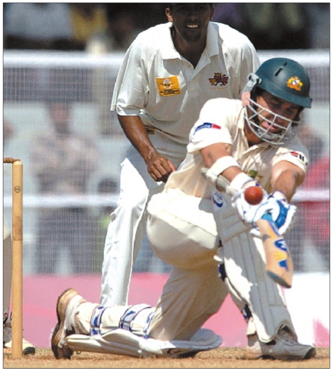
SHAPING UP FOR THE TEST: Australian opener Justin Langer sweeps on way to scoring 108 on the final day