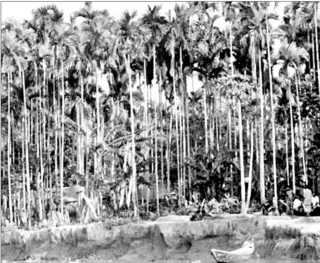
Wrath of nature

Among others, Moulvibazar Press Club President, Sangbadik Samity, Moulvibazar unit President, political leaders and socio-cultural personalities condoled the death and prayed for peace of the departed soul.