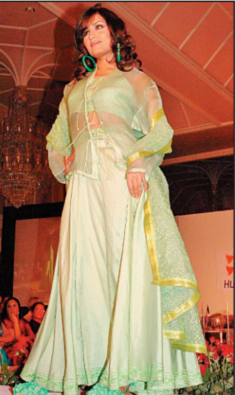
A sample of haute couture by Bibi