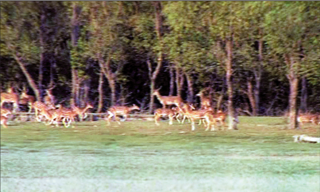
Flocks of Spotted Deer roving on the banks of a canal

The film has some brilliant footage and good narration. However to reach a wider audience it is necessary to have English subtitles. This would make it possible for people all over the world to get a glimpse of this enchanting island.