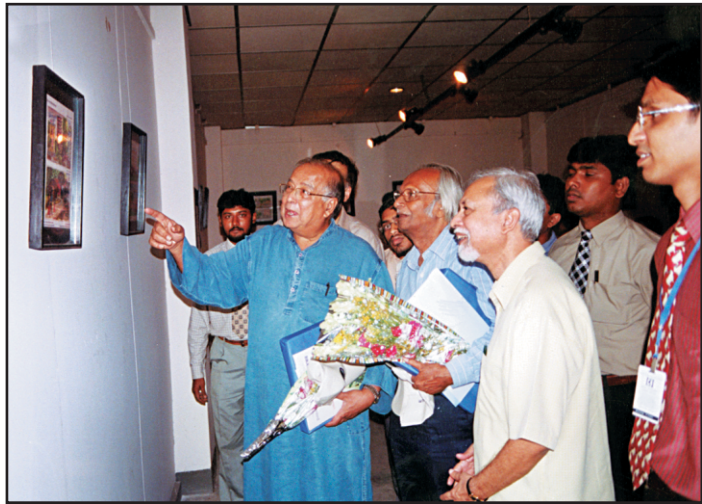
Guests at the inaugural ceremony of a two-day exhibition admire paintings by schoolchildren at the Sculptor Novera Hall in the city recently. Brac Concord Lands Limited organised the two-day exhibition that ended on September 25.

Prof. Hasan Azizul Haque will deliver the lecture with Prof. Shirajul Islam Chowdhury in the chair.