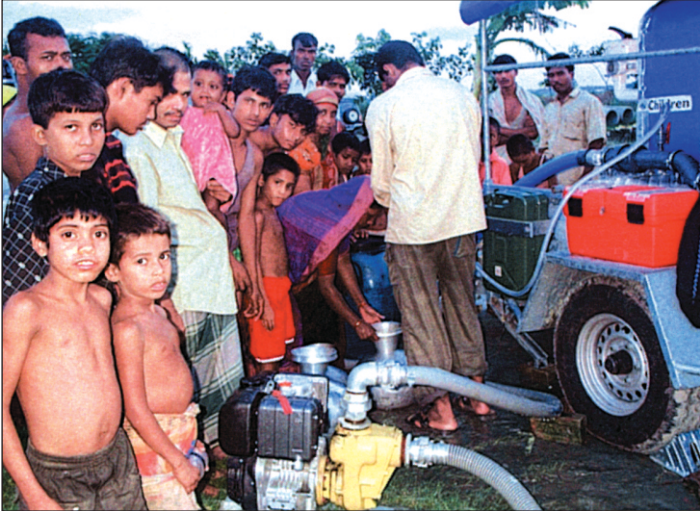
Save the Children (USA) supplies safe drinking water to water-logged people near Mohammadpur embankment in the city recently.