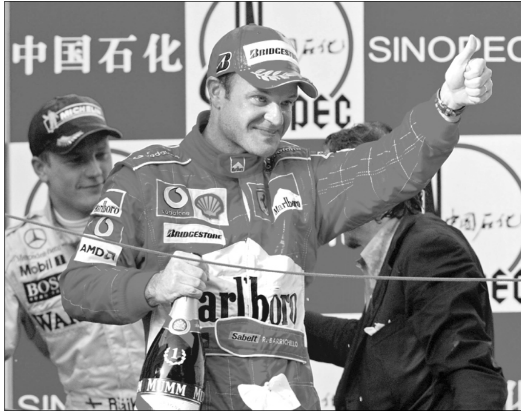
Brazilian Formula One driver Rubens Barrichello of Ferrari gestures during the presentation ceremony after he won the inaugural Chinese Grand Prix at the Shanghai International Circuit yesterday.

"When it became clear that Ralf had only a puncture, it was too late to send him out again."