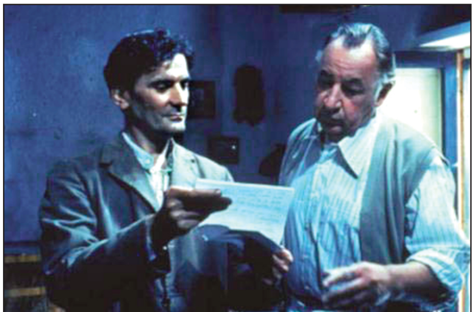
A scene from the movie Il Postino

From the 1940s on, Neruda's poems reflected the political struggle of the leftists and the socio-historical developments in South