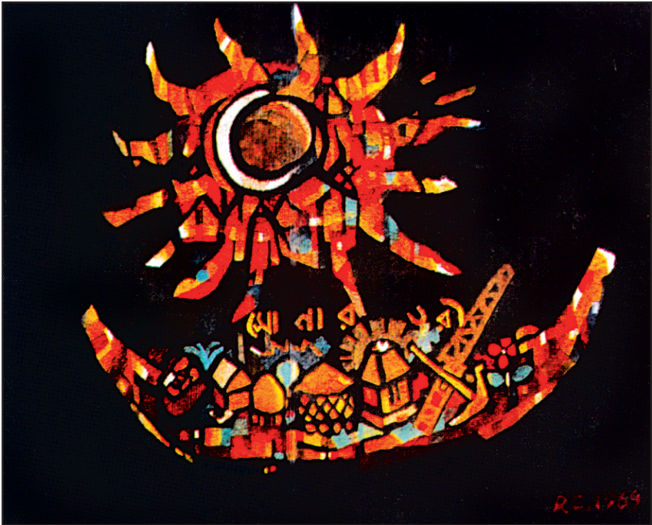
(Above) Shonar Tori (Golden Boat), tapestry; (left) Radha-Krishna 2, oil