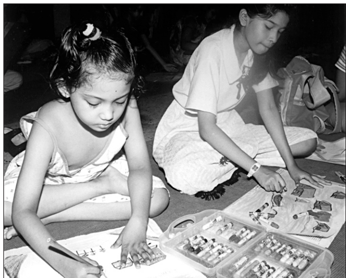
Children take part in an art competition organised by the National Press Club in celebration of its founding anniversary yesterday.

A two-day art exhibition began at National Museum in the city yesterday. The exhibition followed an art competition titled 'Draw your dream house'. Brac Concord Lands Limited organised the competition. Some 2,600 schoolchildren between the age of six and 10 took part in the competition held across the country. Inaugurating the exhibition, artist Hashem Khan said the children want to live in a beautiful environment. The pictures of their dream houses prove that children are pretty conscious about their dwelling places, materials and environment, he added. They drew pictures on 'Rainbow Town' (Ashulia) and 'Rajdhani Prkalpa' of Brac Concord Lands Limited. The pictures will be sold and the sale proceeds will be donated for the welfare of the disabled children, said AJM Sajedur Rahman, marketing executive of the company.