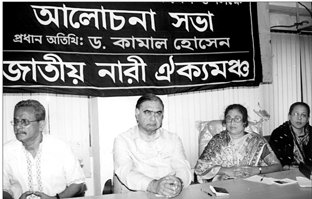
Jatiya Nari Oikyamancha organised a discussion to mark the 'Day of resistance to violence against women' in the city yesterday. Gonoforum President Dr Kamal Hossain attended the function as chief guest.