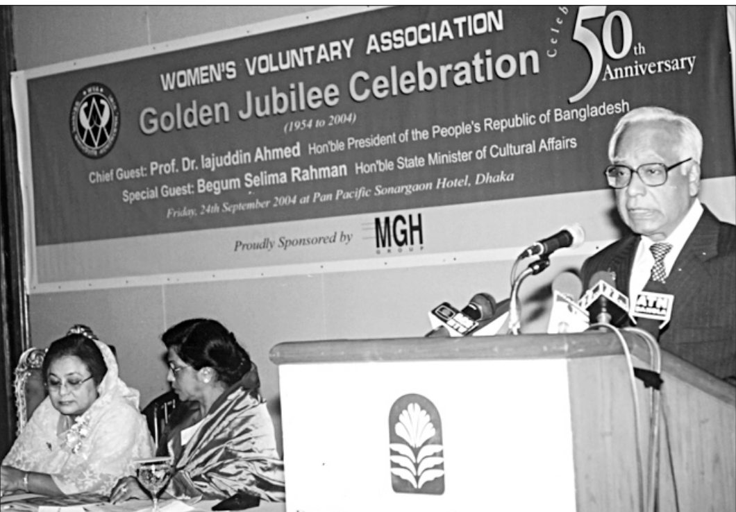
President Iajuddin Ahmed speaks at the golden jubilee celebration of Women Voluntary Association (WVA) at a city hotel yesterday.