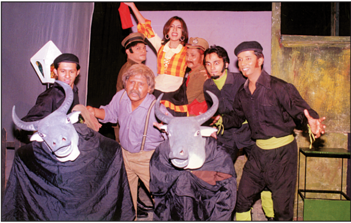
A sequence from the play Golmatha Chokha Matha