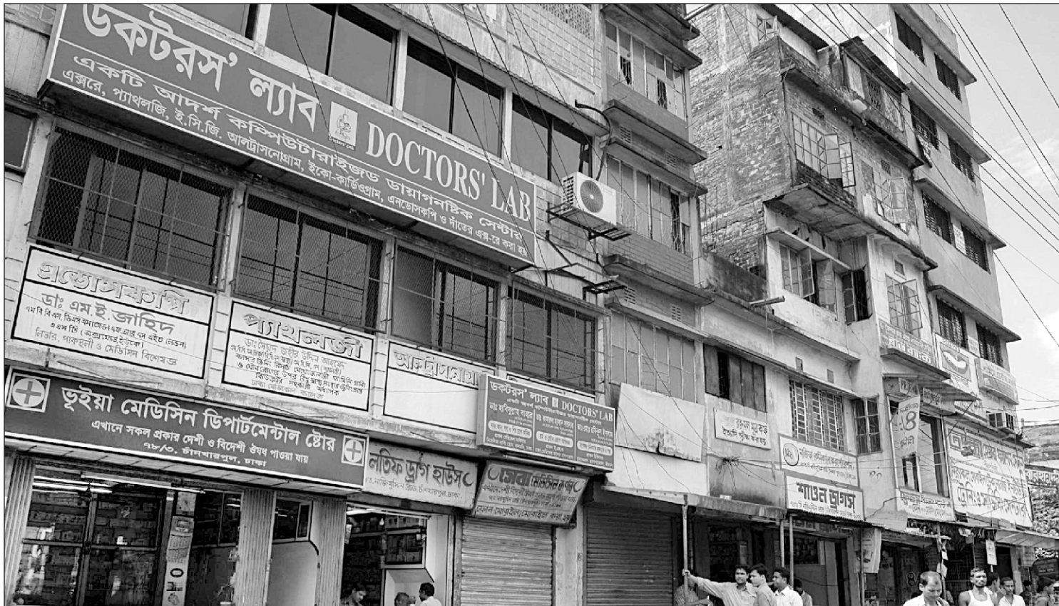
These private pathology labs near the DMCH cater to immediate needs of patients of the hospital.