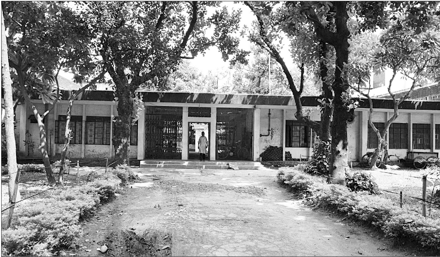
Outdated machinery at Dhaka University's printing press is in crying need of update to fulfill present demands.