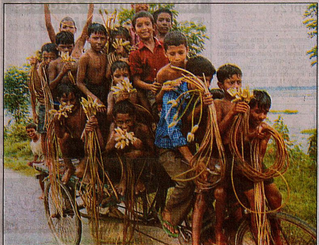
Lilly chariot... a joy ride with 'Shapla' (Water Lilly) plucked from a bog in Keraniganj on the fringe of Dhaka sends some 16 kids floating on air yesterday. Shapla stems are used as cheap, popular vegetables.