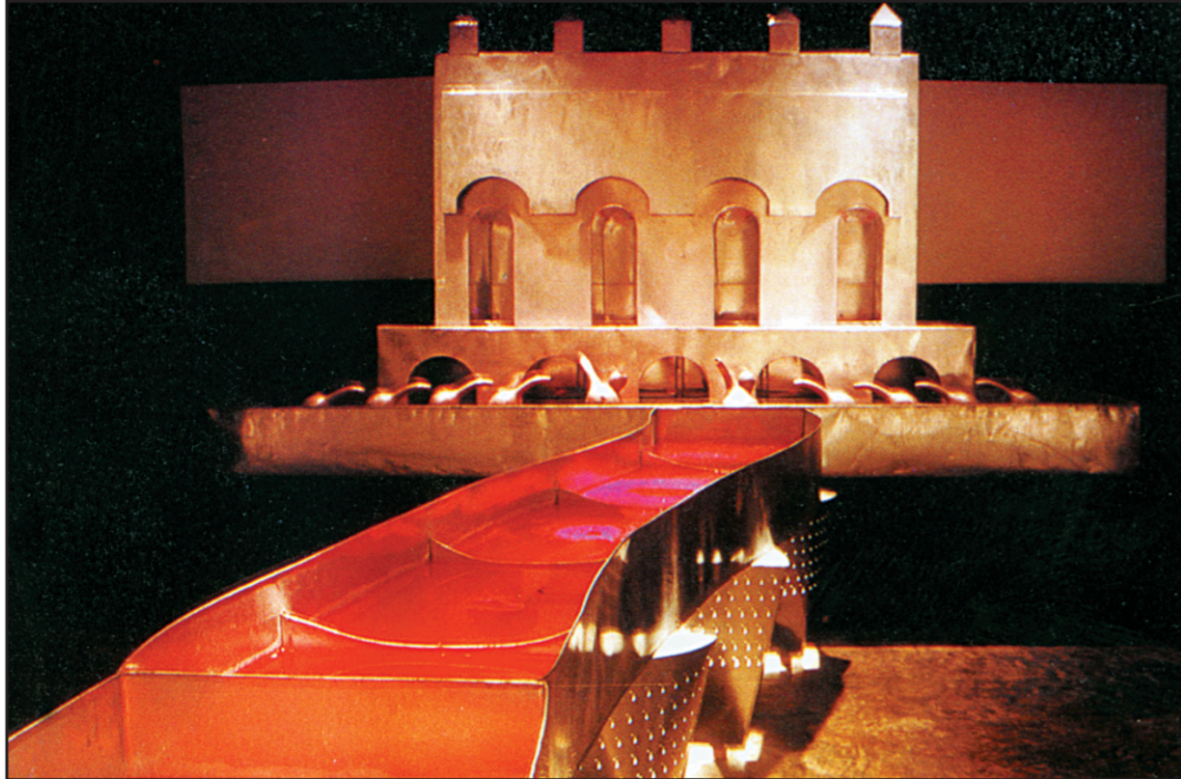
Water is Innocent!: Red water submerges the replica of the Chakma Rajbari

ARTIST Dhali Al Mamoon's assertion 'Water is Innocent!' may sound outrageous especially at this time when many parts of the country are still under water after the heavy down-pour of last week.