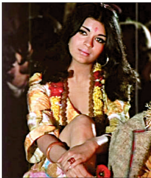
was another instance of Bollywood re-discovering the acting potential of an old-timer in line with Sharmila Tagore, Tanuja, Jaya Bachchan and Moushumi Chatterjee.

When Zeenat Aman, after a long hibernation from cinema, staged a comeback to movie with Bhopal Express and Kaizad Gustad directed Boom recently, it