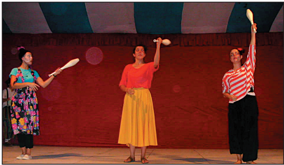
Performers seen at an enchanting evening

The four young ladies said that they performed in France in the same manner, going along the streets of France, not minding any bad weather or odd response as they had been trained to act at any cost. They acted both with adults and children in France, and here they had worked with 20 street children, at a boys' hostel in Dhaka.