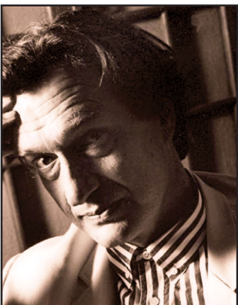
German film maestro Wim Wenders

produced films like The American Friend (1977), Nick's Film Lightening over Water (1980), The State of Things (1982, winner of 'Golden Bear' at Berlin), Hammett (1983), Paris, Texas (1984, winner of 'Golden Palm' at Cannes).