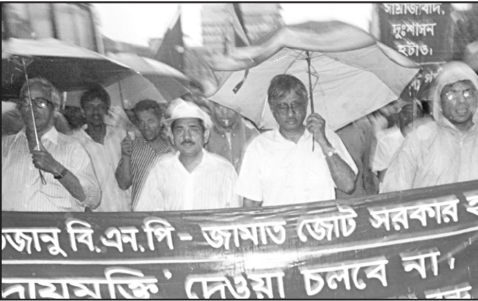
Communist Party of Bangladesh stages a demonstration in the city yesterday protesting the government move to give immunity to World Bank.

Additional police have been deployed in front of the provost's house.