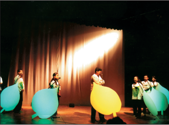
A glance at Halud Patar Gan